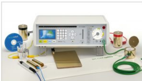
BICOM® B22

Among other conditions, BioResonance has been associated with improvements in the progression of liver cell damage [3] and faster recovery rates from injury [4]. According to a recently conducted meta-analysis, BioResonance techniques are associated with greater rates of recovery from symptoms (i.e., 31% reported 'significant improvement').