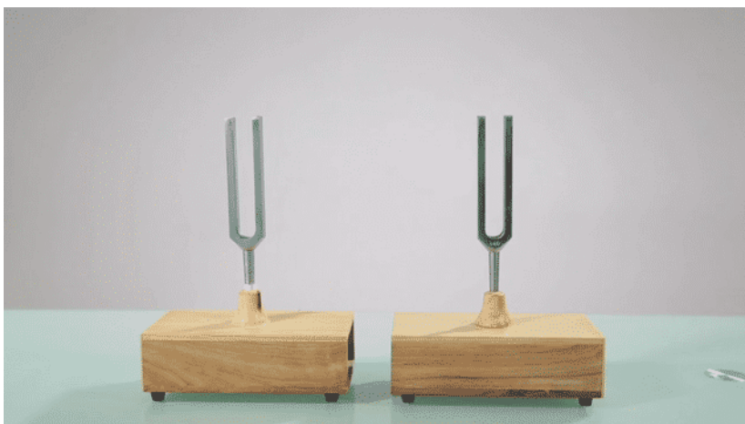
Demonstration of resonance

Bioresonance (not to be confused with biofeedback therapy) uses the frequencies emitted by living cells in the body as the information needed to facilitate treatment therapy, much like the tuning of a musical instrument. (Granted, the frequency range of cells is much lower than that of piano strings, but can still be measured with regular electronic equipment.) If you are familiar with tuning a piano then you would understand that tapping a tuning fork will cause the piano string that has the same frequency to vibrate. A simple scientific fact.